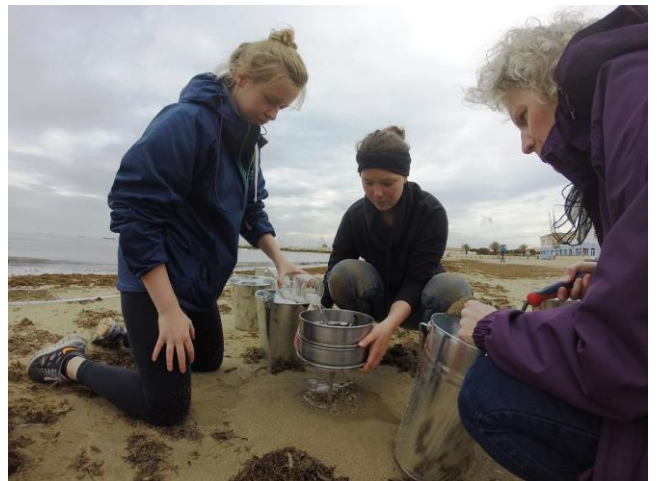
A ROCHA's marine team sampling microplastics in the Camargue region, France