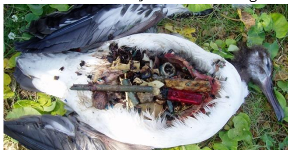
The stomach contents of a dead albatross