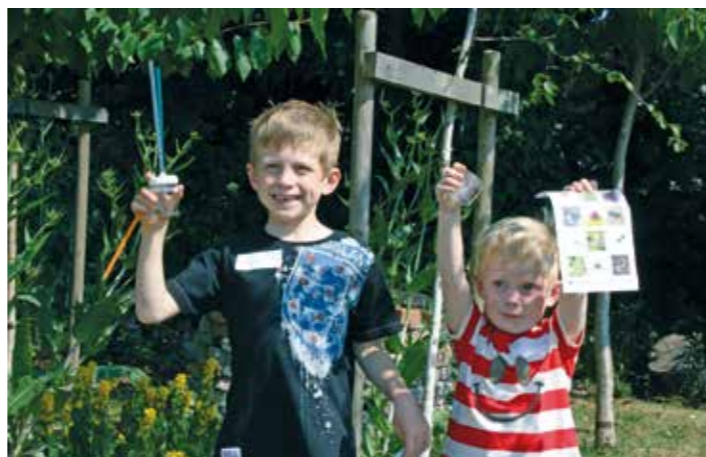
St Luke's, near Liverpool, is an Eco-congregation church which has transformed its grounds to create 'a place of beauty and a haven for people and wildlife'. The new gardens have led to a big increase in butterflies, bees and other insects. The two boys are enjoying a bug safari.

My sensitivity to environmental issues was nurtured during my undergraduate years, studying urban planning and land use. Later, in my pastoral ministry, seeking a way to address the challenges of disciple-making in our contemporary, consumer culture, I looked into the need for re-envisioning a biblical worldview. Reading the Bible afresh, I came to understand that caring for God's creation is fundamental to the whole narrative.