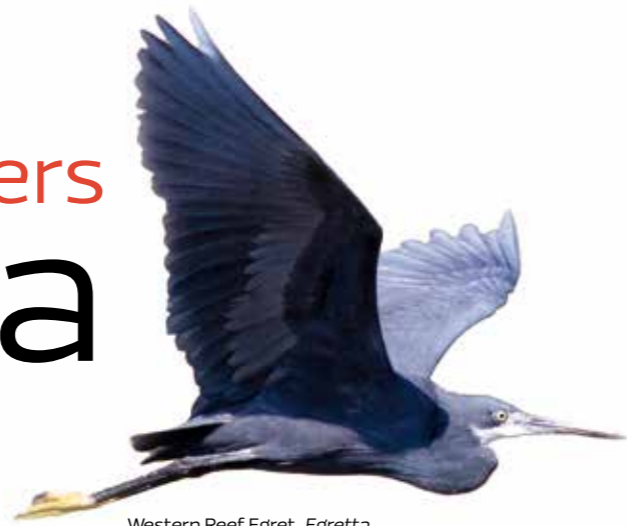
Western Reef Egret, Egretta gularis, is just one of many species dependent on healthy coastal wetlands.