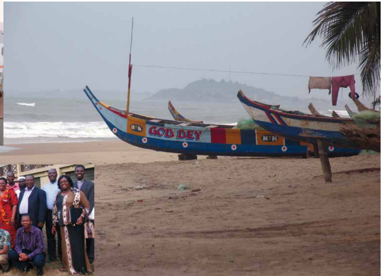
Muslim clerics and Christian ministers at an A Rocha 'Faith in Action' workshop on the coast.